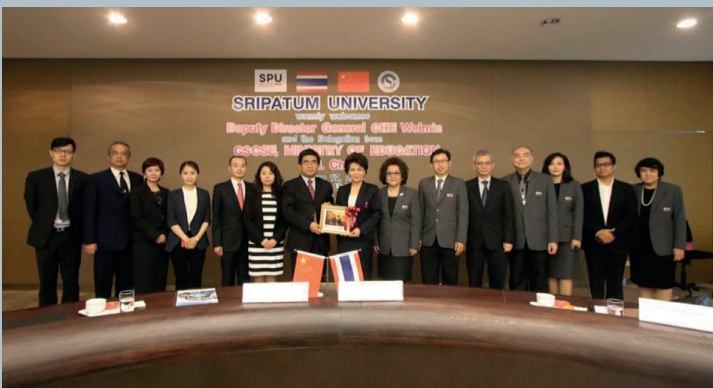
Deputy Director General & Delegation of China Service Center for Scholarly Exchange (CSCSE) under Ministry of Education, P.R.China made a Special visit to Sripatum University